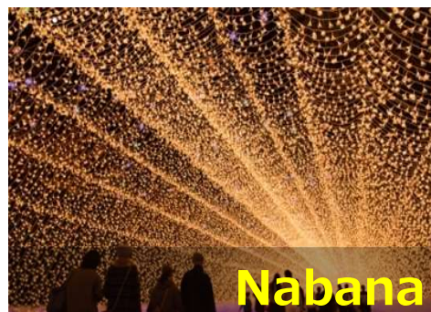
Nabana no Sato