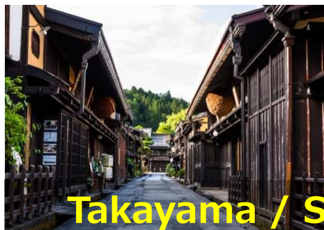
Takayama / Shirakawago