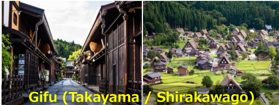
Gifu (Takayama / Shirakawago)

Takayama is known as a little Kyoto, which has a very quaint atmosphere. Shirakawago is the world heritage site that is surrounded by mountains and its unique and traditional life-style.