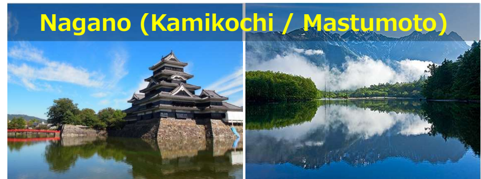
Nagano (Kamikochi / Mastumoto)

Kamikochi is closed in winter by snow and only accessible and shows beautiful scenery in warm season when the snow melted. Matsumoto Castle has an elegant structure with black and white, designated as one of five castles of National Treasure.