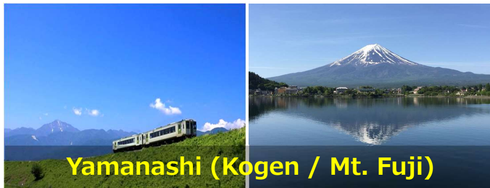
Yamanashi (Kogen / Mt. Fuji)

Takayama is known as a little Kyoto, which has a very quaint atmosphere. Shirakawago is the world heritage site that is surrounded by mountains and its unique and traditional life-style.