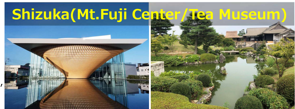
Shizuka(Mt.Fuji Center/Tea Museum)

Mt.Fuji World Heritage Center was established after its designation of World Heritage to maintain our important heritage. Also, let's learn about tea culture at newly opened museum.